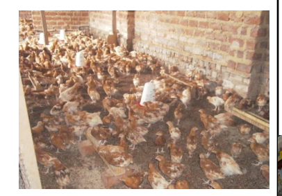
After two months old