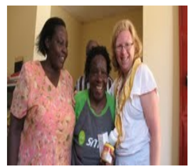
CIRCLE OF PEACE SCHOOL INVOLVED IN PEACE STUDY