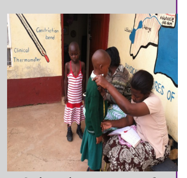
Students taking measurements for their new uniforms